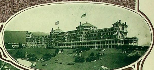
MT. WASHINGTON HOTEL, N.H.